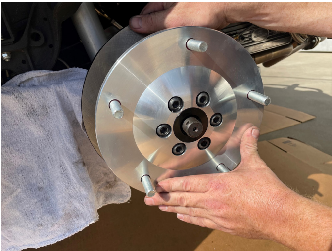
8 - Slide the hub onto the axle. Torque the axle nut to 250 lbs. Install the cotter pin.