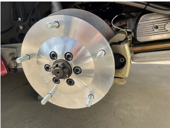
9 - Locate the caliper over the rotor. Install the two

mounting bolts. Depending on exact axle length, it may be necessary to place shims between the caliper and the aluminum mount to assure proper alignment. Torque the mounting bolts to 24 lbs.