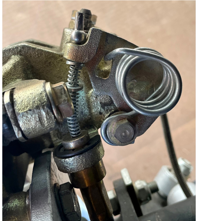
10 - Install the new parking brake cables. Connect the brake lines and bleed the system.

NOTE: Use the supplied shims (if necessary) to shim the brake caliper to properly align the brake caliper with the rotor. Secure the shims between the aluminum caliper bracket and brake caliper.