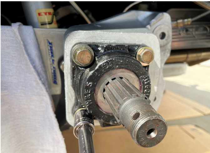
7 - Bolt the bearing/seal retainer cap into position. Torque the bolts to 24 lbs.